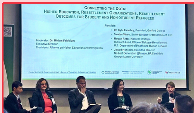
SHERR workshop at University of Maryland, College Park, MD.