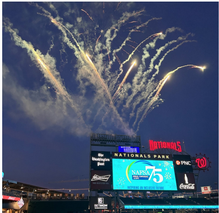
NAFSA 75th Annual Conference opening celebration at Nationals Park.

Another highlight for me included meeting with one of our active ECE® Aid participants, the <u>Ethiopian Community Development Council</u> (ECDC), at its national headquarters in Arlington, VA. I always appreciate meeting with colleagues in person to speak about potential collaborative projects and how we can support each other with those we serve. It was an excellent meeting, and I thoroughly enjoyed speaking with staff at ECDC.