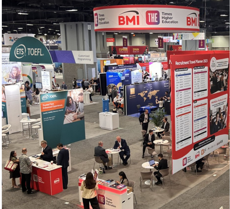
NAFSA 75th Annual Conference expo hall.

This year, I was fortunate enough to present at one of the poster fairs, which I will talk about more on the next page.