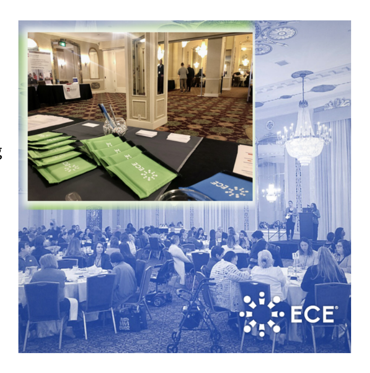
Views from NAFSA Region V conference in Milwaukee, WI