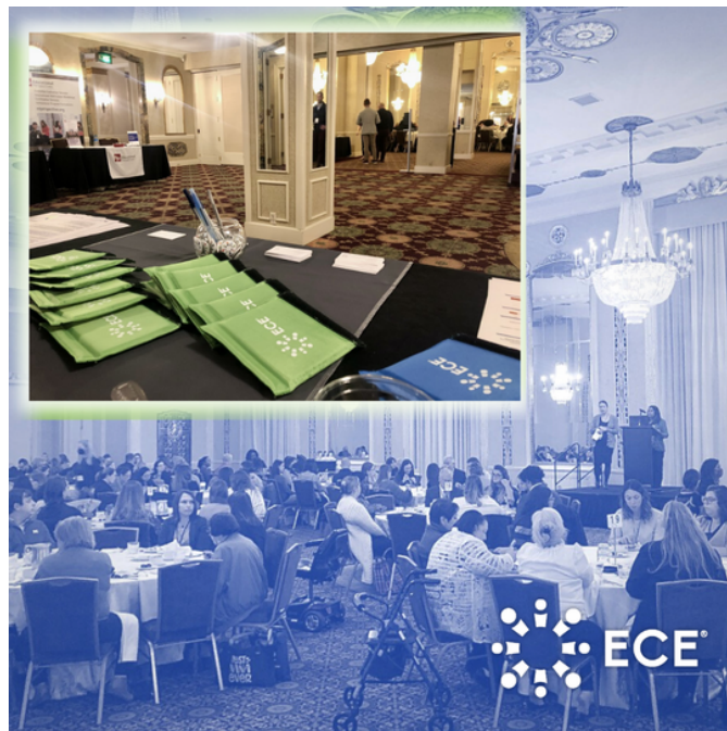
Views from NAFSA Region V conference in Milwaukee, WI